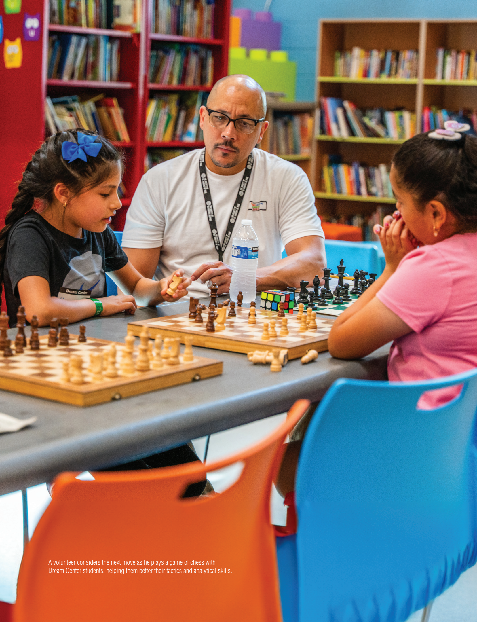
A volunteer considers the next move as he plays a game of chess with Dream Center students, helping them better their tactics and analytical skills.