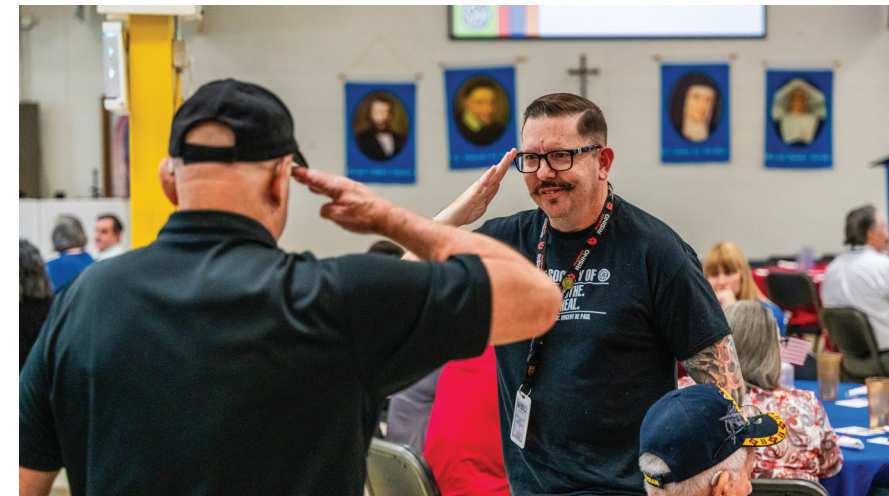
SVdP's inaugural Veterans Day event.