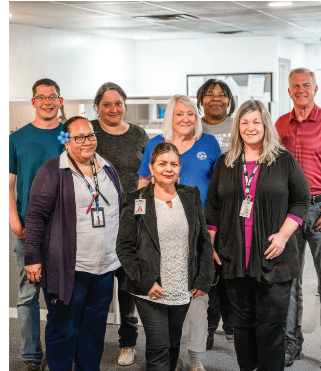
Homelessness Prevention Team