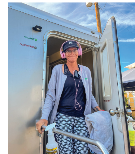
A partnership with Arizona Jews for Justice and Uri L'Tzedek brought free mobile showers to Mesa Dining Room.