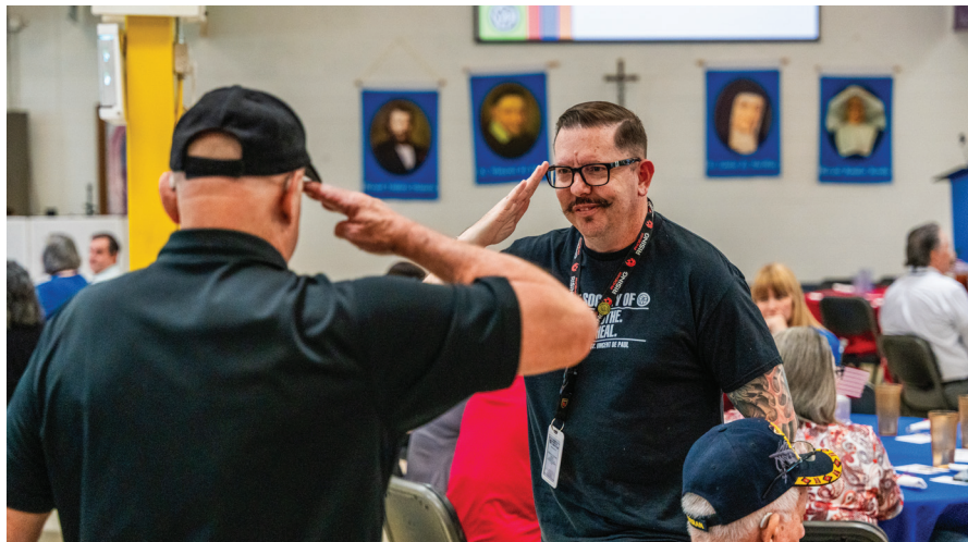
SVdP's inaugural Veterans Day event.