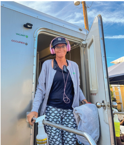
A partnership with Arizona Jews for Justice and Uri L'Tzedek brought free mobile showers to Mesa Dining Room.