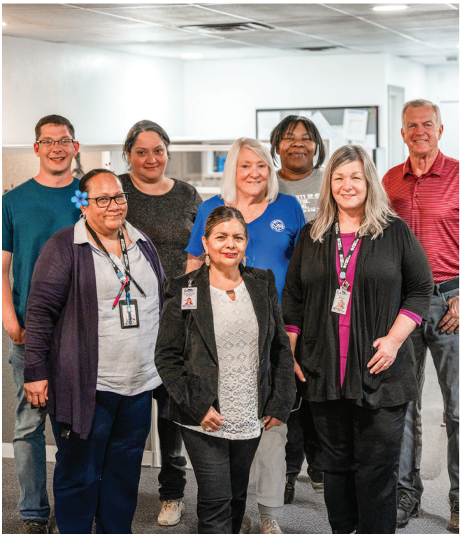
Homelessness Prevention Team