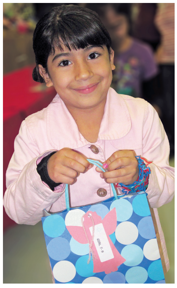
From practical gifts, like a new vacuum, to fun things for kids, like a Game Boy, the Adopt-A-Family program helped make Christmas for a record 900 disadvantaged families last year.

At the heart of the Adopt-A-Family program are those "family-to-family" experiences that keep people coming back year after year. Here are just a few of those stories.